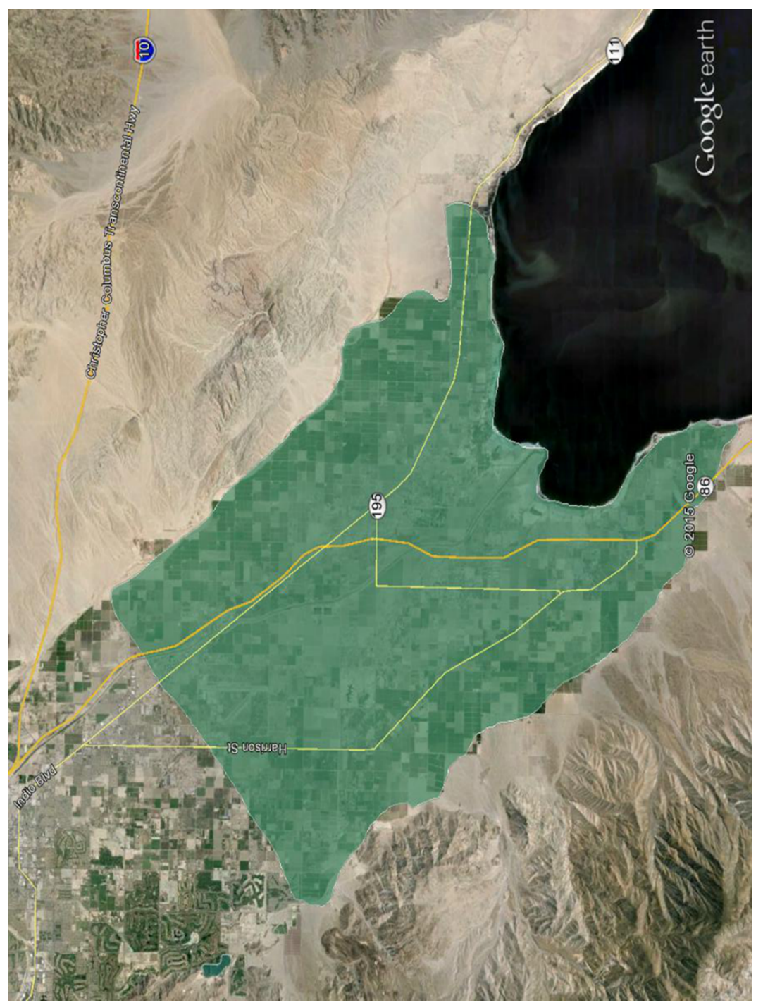
CALIFORNIA REGIONAL WATER QUALITY CONTROL BOARD COLORADO RIVER BASIN